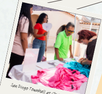
San Diego Townhall at Christ the King September 1, 2024