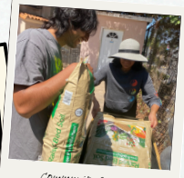
Community Garden at CTK July 20, 2024