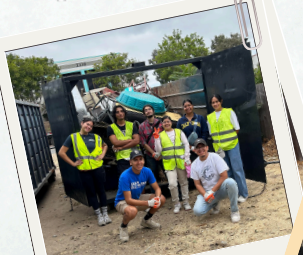
Stockton Community Clean-Up September 14, 2024