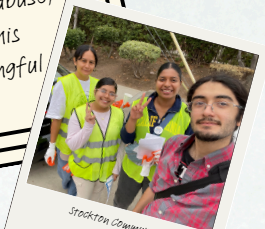
Stockton Community Clean-up September 14, 2024